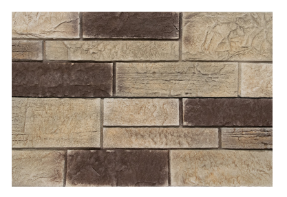
AUTUMN MOON - Classic Ledge

provide character and depth, offering a wide array of application options.